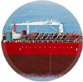
Simple Crew Manning Scheme

We offer high quality services devoting our full attention to the human factor and depending on the Principals' differing needs, we offer the following options: