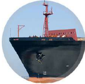
Crew Management all inclusive package