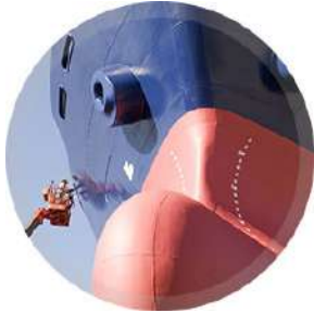
Crew Management at cost with supporting vouchers